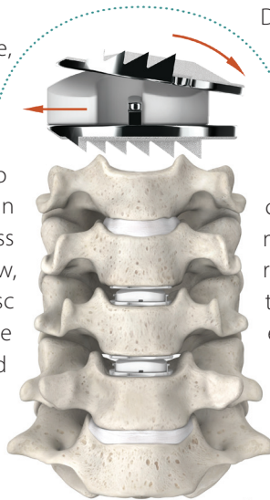
©2014 LDR Spine USA, Inc. All rights reserved.

in 2019, at the North American Spine Society