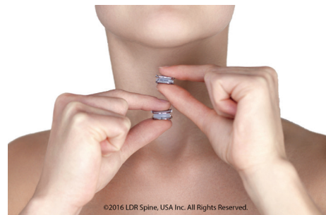
©2016 LDR Spine, USA Inc. All Rights Reserved.